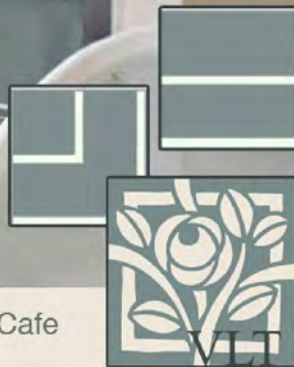
COLOR: Green Asia and Cafe