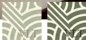
TILE: Props COLOR: Sage/Clam and Green Asia/Clam

Visit our web site to see the full collection: www.VillaLagoonTiles.com/stu-neyland-tile-collection.html